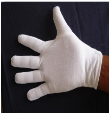
WHITE BANIYAN GLOVES